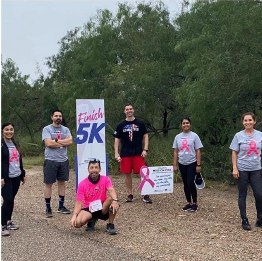
Participants at the 11 th Annual Virtual Mission Pink Walk/Run for Breast Cancer Awareness at the Mission Hike and Bike Trails in Mission, TX.

Grande Valley, so no person would be left out of the event. These efforts are driven by the common goal of reminding women about the importance and benefits of mammograms in order to detect any health issues as soon as possible.