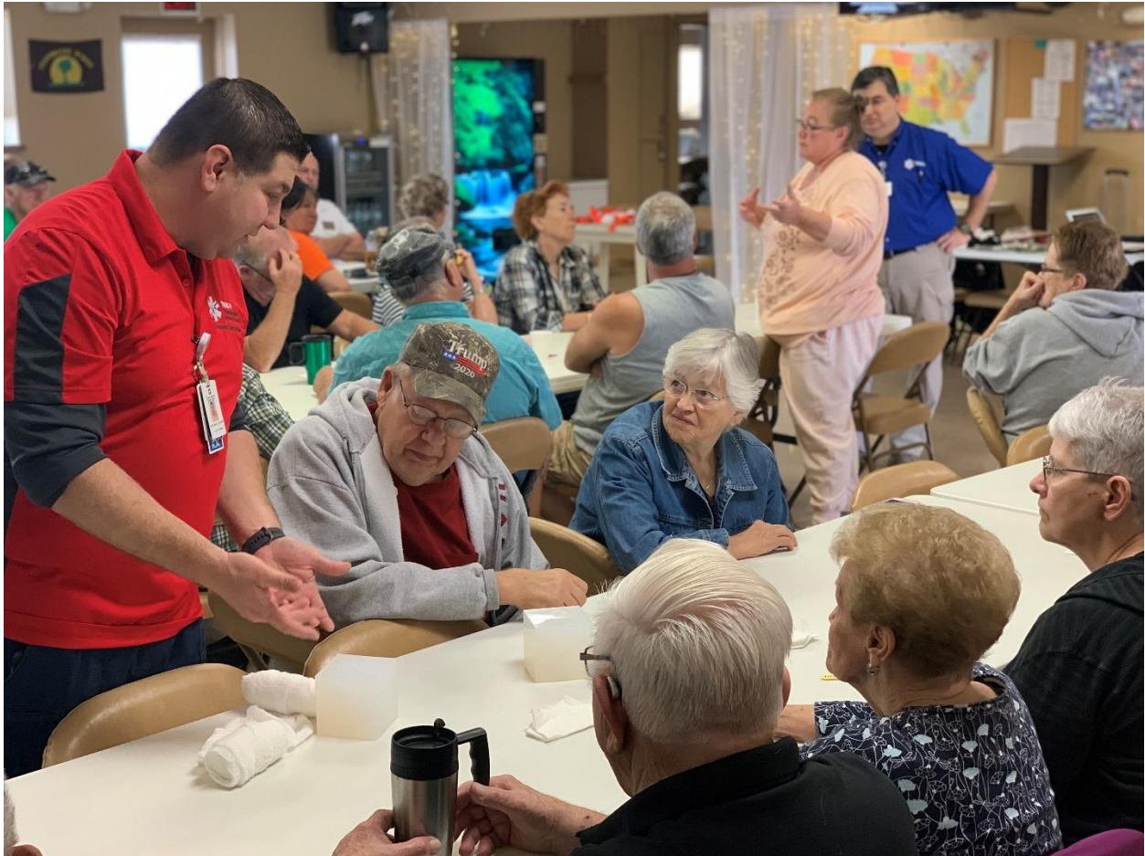
Our trauma department team teaching residents from an RV park on what to do in case of bleeding

Mission Regional Medical Center has welcomed our Winter Texans with open arms for as long as they have been visiting the Rio Grande Valley. Our Marketing and Business Development Team coordinates health presentations, screenings, flu shots, educational presentations, and even interactive discussions with local physicians at a variety of community meetings